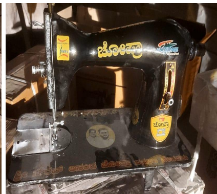
Over 1000 sewing machine seized from a godown in Savadatti AC

The extensive monitoring process started months back before the announcement of elections and includes host of activities like thorough review of preparation of different stakeholders including enforcement agencies, DEOs/SPs, appointment of experienced officers as Expenditure Observers, sensitizing and inter-agency coordination & monitoring and adequate availability of field level teams. 146 Expenditure Observers were deployed and 81 Assembly Constituencies were marked as Expenditure Sensitive Constituencies for stricter vigil.