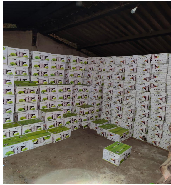
Seizure of Ganja at Gandhi Gunj PS limits in Bidar district & pressure cookers in Bailhongal AC in Belgavi district