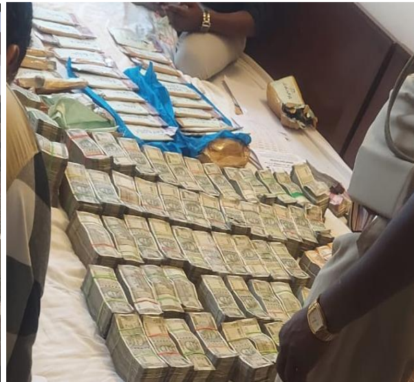
Seizure of liquor in Bengaluru & heavy cash seized in Bangarapet AC in Kolar district

Notable hauls include seizure of Rs 4.04 Crores of cash in Bangarapet AC in Kolar District, raid of lab illegally manufacturing Alprozolam in Hyderabad by intelligence gathered and trail mapping done by NCB; 100 kg ganja seized in Bidar district; significant liquor seizures have been made by all the districts. Another striking feature of expenditure monitoring has been huge seizures of freebies. Sarees and food kits have been seized from Kalburgi, Chimangalur and other districts. Huge number of pressure cookers and kitchen appliances were also seized from Bailhongal and Kunigal and other ACs.